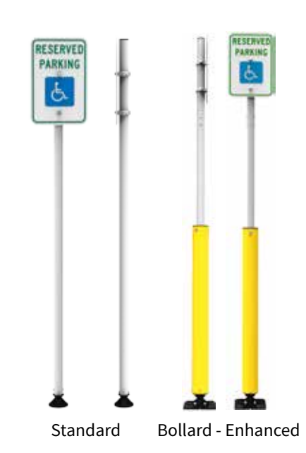
Sta-Rite Aluminum Handicap Parking Sign